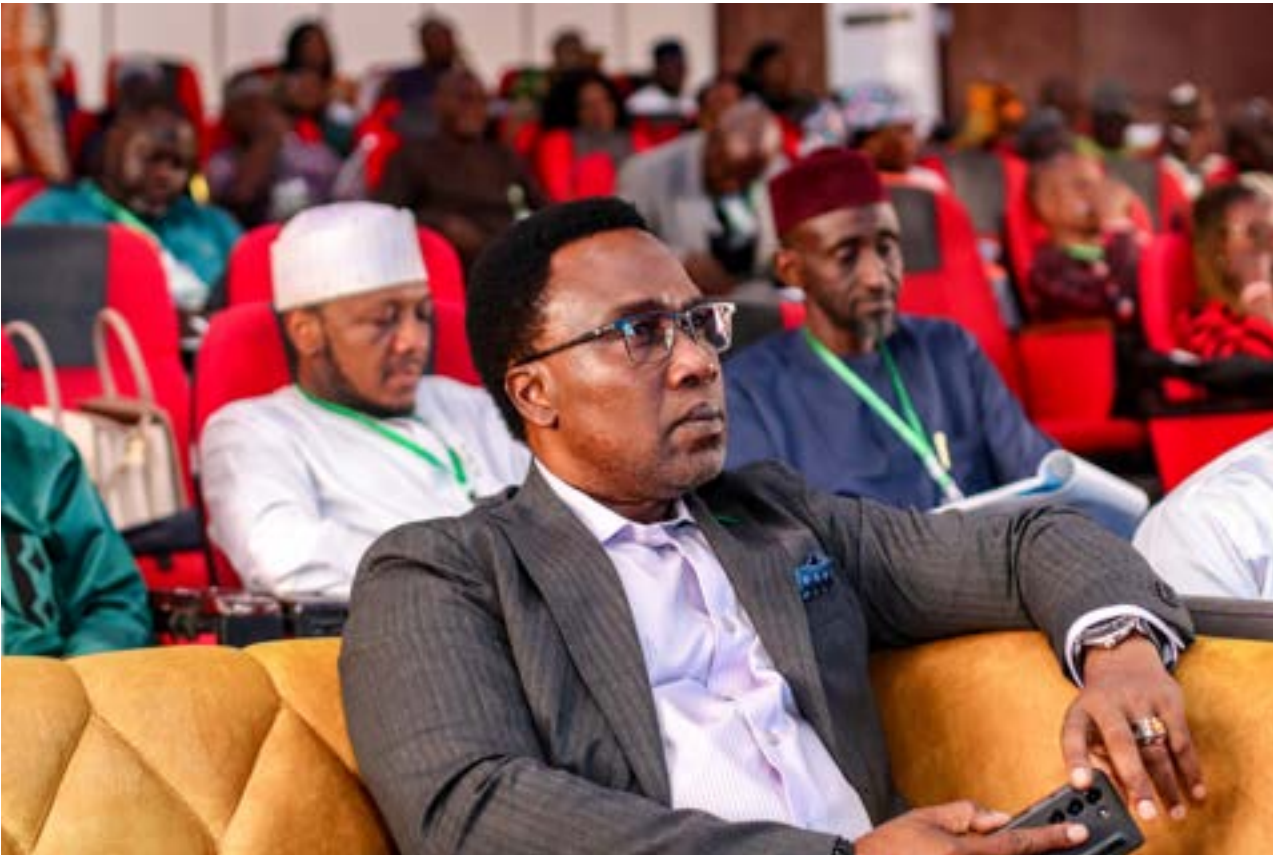
Training Sessions with NYSC Staff

Our vision is to be a world-class professional body, a pan-African best reference in strategic management, and a key player in positioning Nigeria and Africa for leadership in the global society.