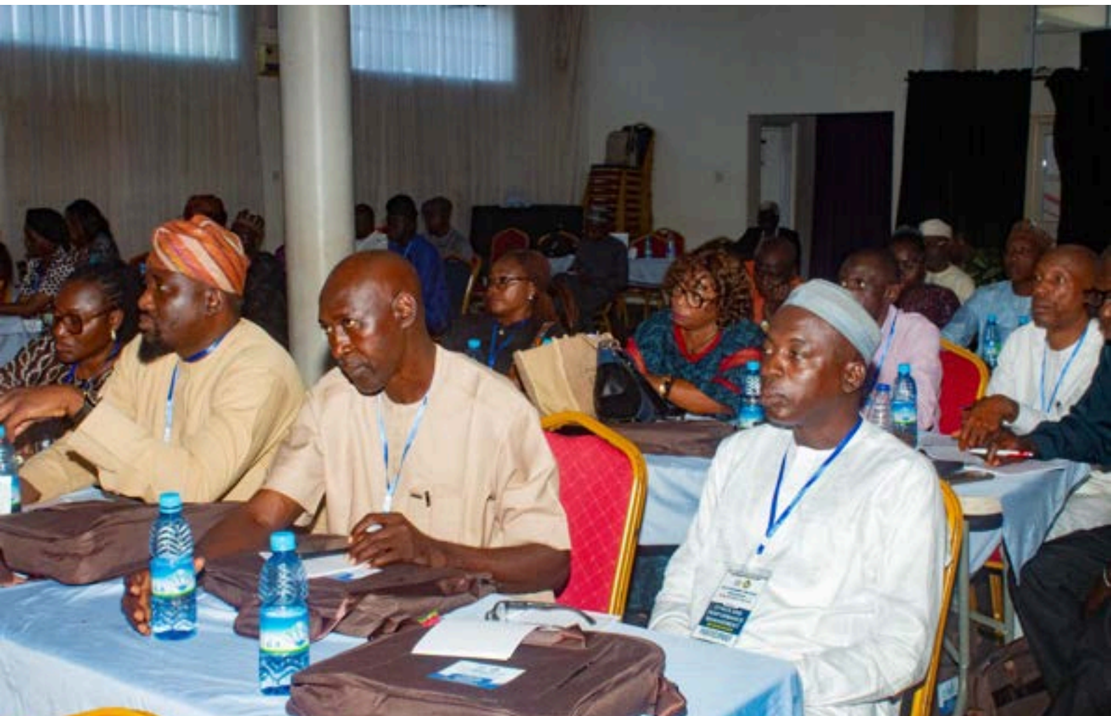
Training Sessions with NYSC Staff Members