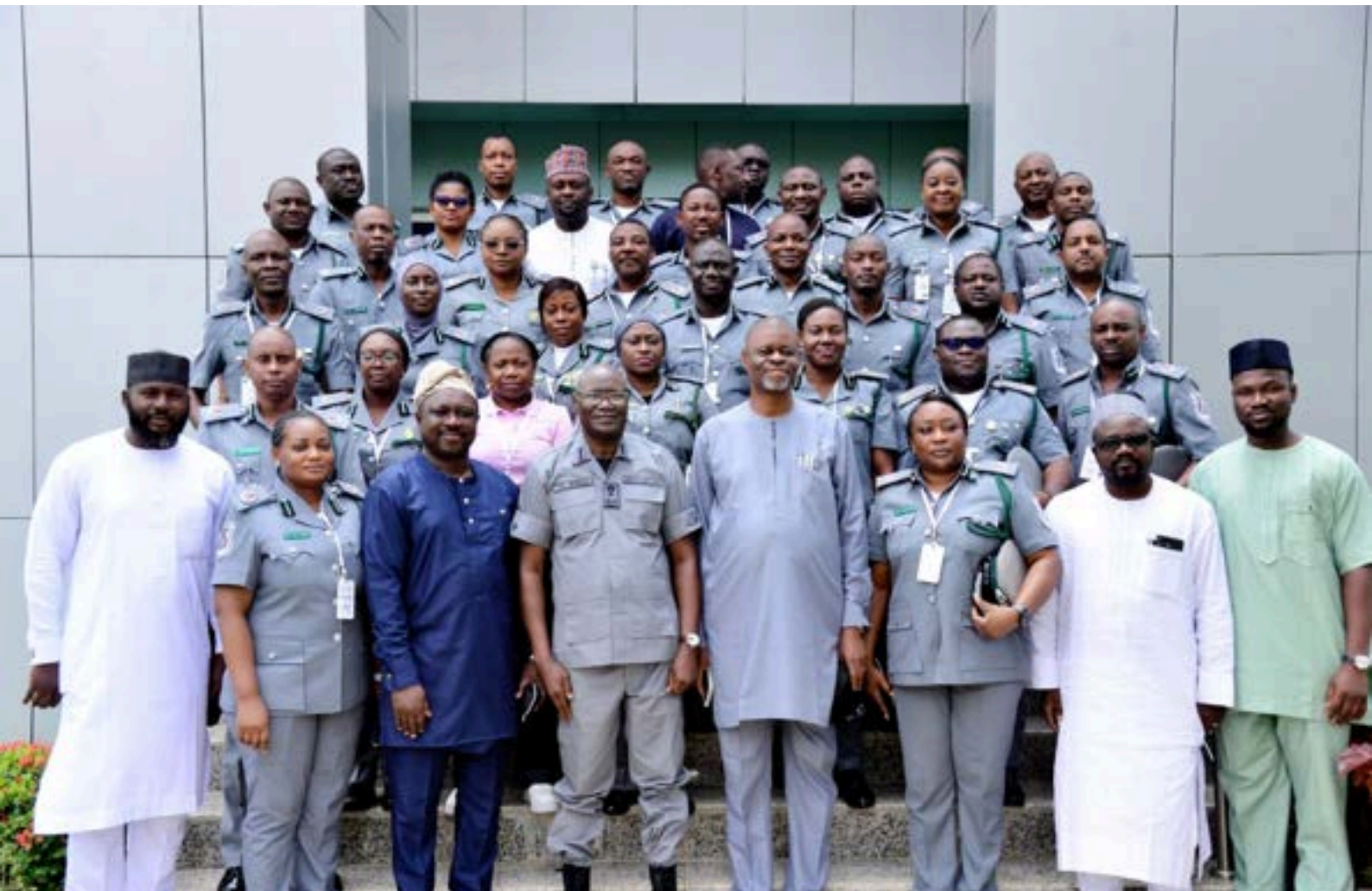
Customs Training Session