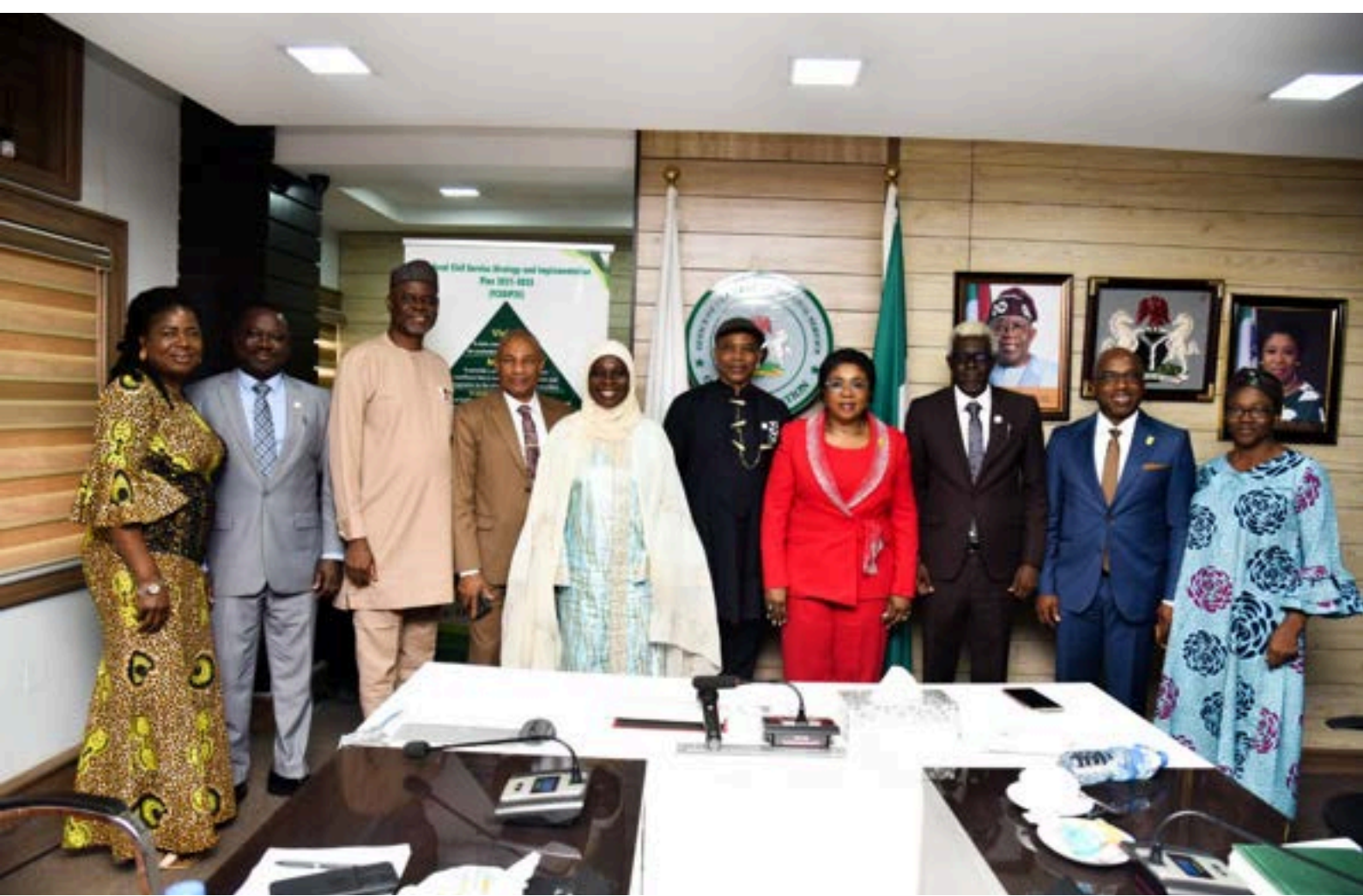
Training with Office of the Head of Civil Service of the Federation