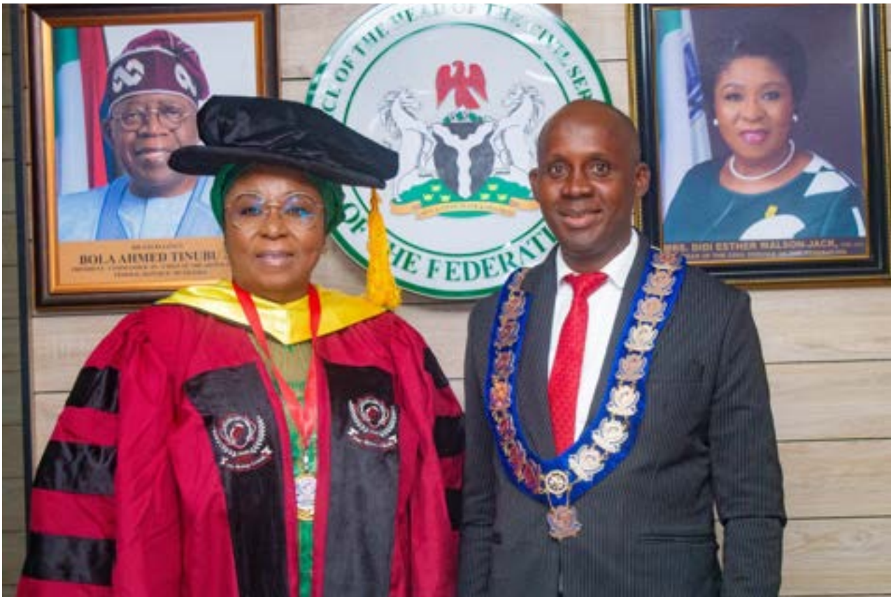
Office of the Head of Civil Service of the Federation Induction Session

Founded in 2003, and chartered in 2023, the Institute of Strategic Management of Nigeria (Chartered) is Africa's premier Institute for strategy crafting. As a non-government, non-profit, independent professional, learning and research organization with an extensive range of courses in Strategic Management, Leadership, Entrepreneurship, Governance, and Digital Innovation we set the pace for executive training and professional development.