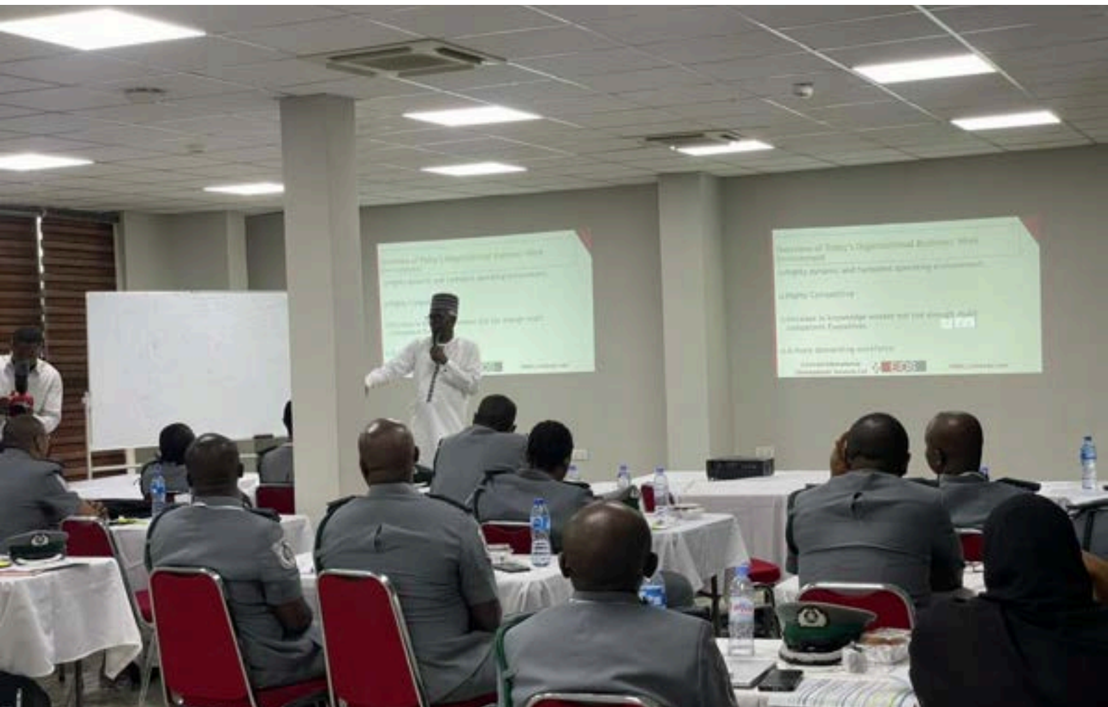
Customs Training Session