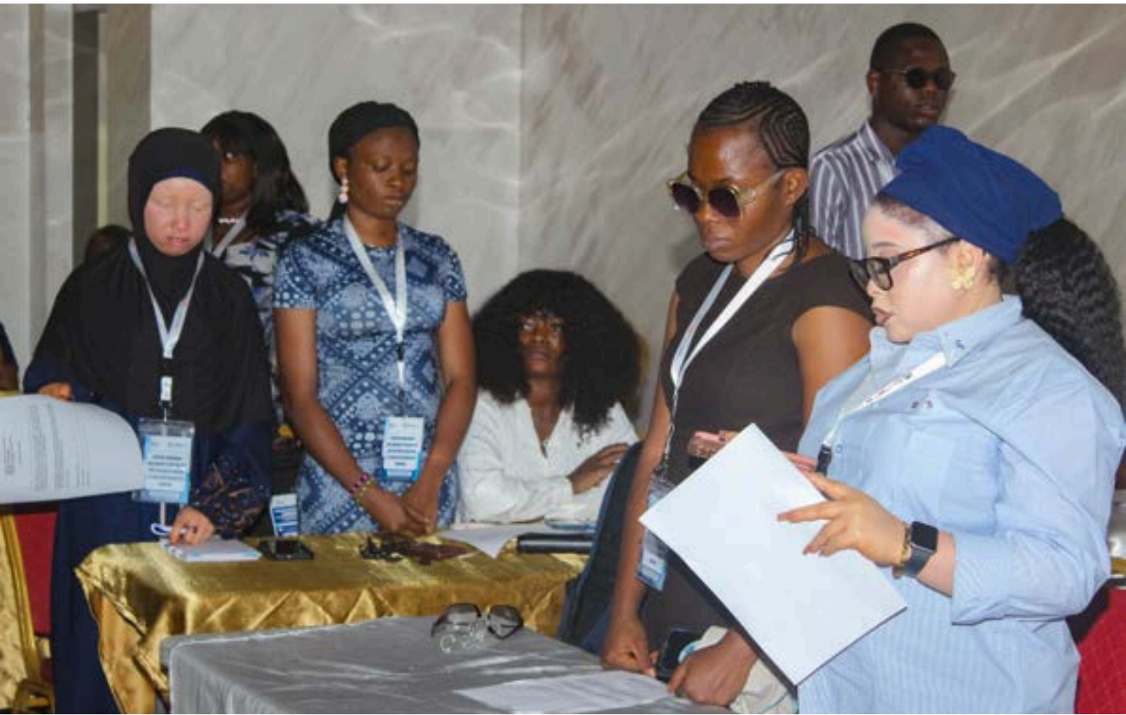
Training Session with Joint National Association of People With Disability