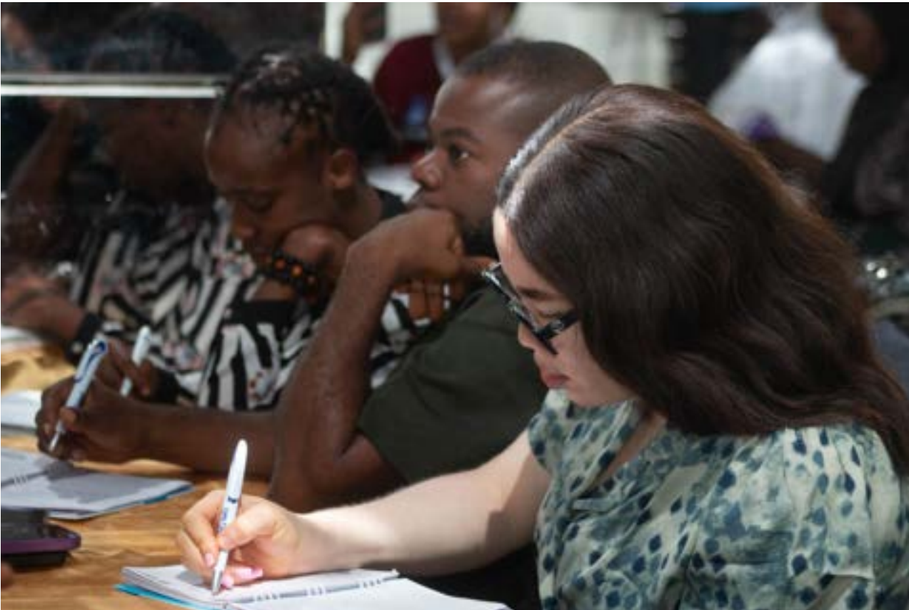
Training Session with Joint National Association of People With Disability

Our mission is to advance and promote knowledge and skills in the practice of strategic management, strategic leadership, strategic entrepreneurship, and governance through research, publications, education, training, certification, induction and regulation of students and members.